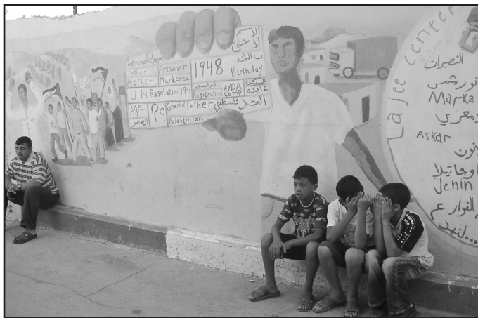
Nakba mural in Ayda Camp, Bethlehem

It has been revealed by historians, including the Israeli academic Ilan Pappé 4 , that the Nakba was the result of a determined policy of ethnic cleansing, to drive out the Palestinian population and ensure the Israeli state would have a large Jewish majority. (See the PSC Nakba factsheet for more information).